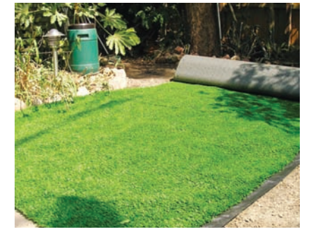
Laying the turf Fill any surface dips or hollows with fine sand. Lay out the first roll of turf, allowing overhang at the ends. This will later be trimmed to match the contour of the paving.