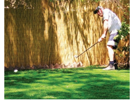
Sweeping in the sand Distribute the sand evenly with a yard broom, sweeping against the direction of turf fibres. Cast more sand and repeat the process until the sand is about 10mm deep. This is also the perfect time to practice your chipping!