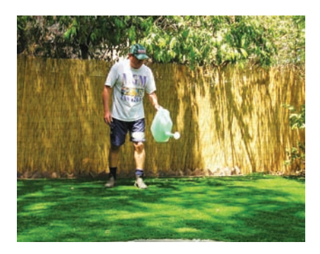
Forget watering Put away the watering can, as the natural-looking turf will stay this way for years. Just use a rake, broom or outdoor vacuum to keep it tidy.