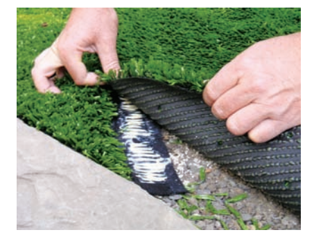
Invisible seams Wait for the adhesive to become slightly stringy, then bring the two sheets together. Make sure there are no turf fibres trapped in the seam as you smooth the sides down.