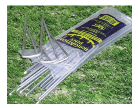
Anchoring the turf Use 150mm irrigation pins around the perimeter of the turf, and space them throughout the area in a 600mm grid. Push fibres of turf away from under the pins so they sit flush with the surface.