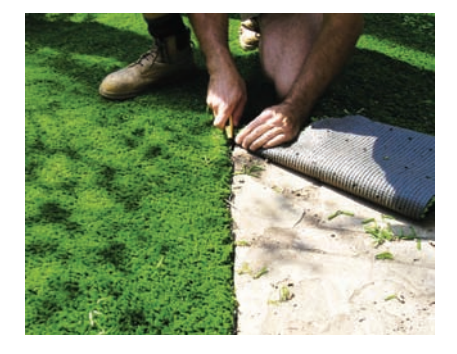
Cutting to size Trim the turf roughly around any garden edges and move it into position. Then use a utility knife, with a new blade, to trim accurately around the edges.