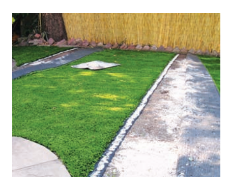
Laying the second roll Lay out the second roll of turf and trim to size. Fold back the edge and apply an even coat of adhesive, such as Bostik Synthetic Turf Adhesive, to the seaming material. Use a 3mm notched trowel for uniform coverage.