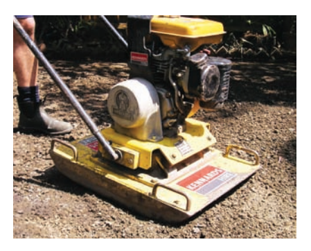
Adding the roadbase Spread a layer of roadbase, or crusher dust, to about 15mm deep. Distribute it evenly with a steel rake then sprinkle with water before compacting with the whacker packer.

HINT When ordering two or more rolls of turf be sure to ask for rolls with identical grain direction so it lays uniformly and appears more natural.