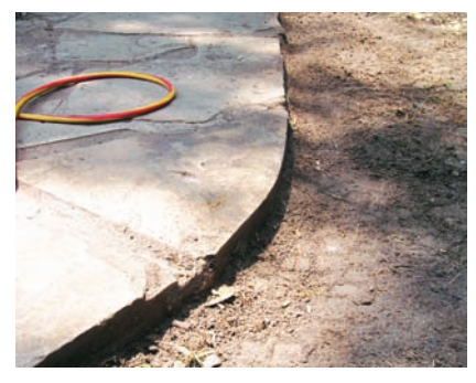
Clean up the edging Scrape away the existing ground to about 20mm below the finished height of any adjoining paved areas or garden edging.