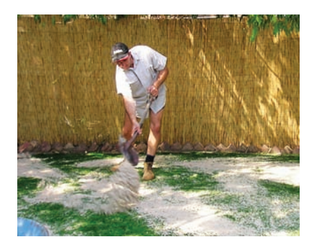
Casting the sand Cast a layer of dry, white, washed sand over the turf with a shovel. This weights the turf to keep it in position, and assists with drainage.