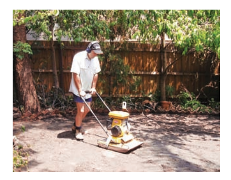
Compacting the soil The subsoil should be dampened lightly with water before being compacted. Use a whacker packer or garden roller to do the job effectively.